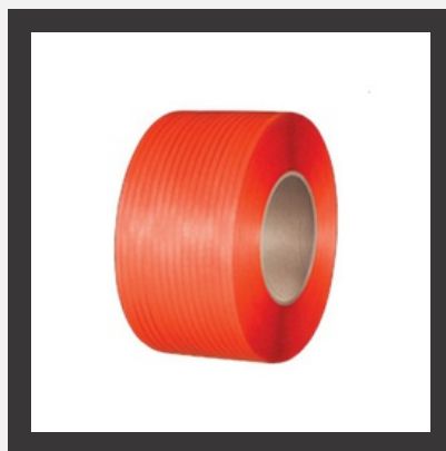
PP Strapping Roll