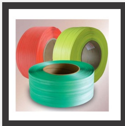
Box Strapping Roll