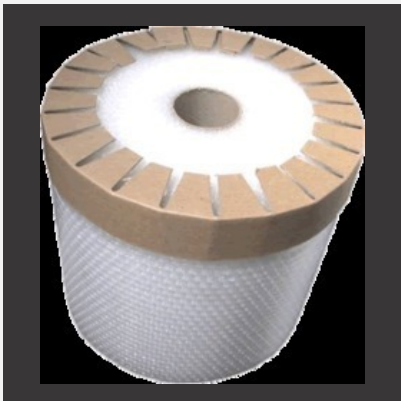
Paper Edge Protector