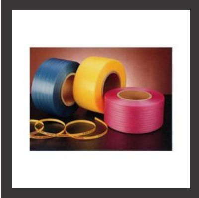
Heat Sealing Polypropylene Box Strappings