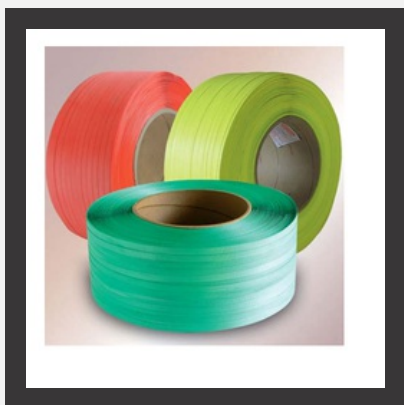
Box Strapping Roll